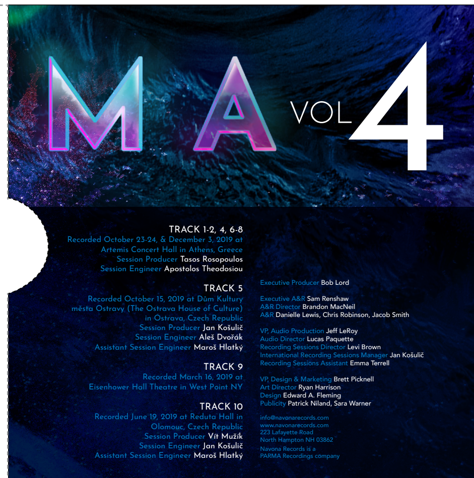
INSIDE RIGHT / DISC POCKET